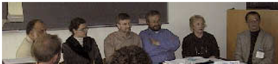
The new Board