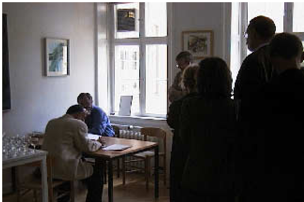
Signing the Statutes

Subscription rates for Full Members will be 300 ECU per annum, and 150 ECU per annum for Associate Members, apart from Associate Members from the East European countries who will not be charged.