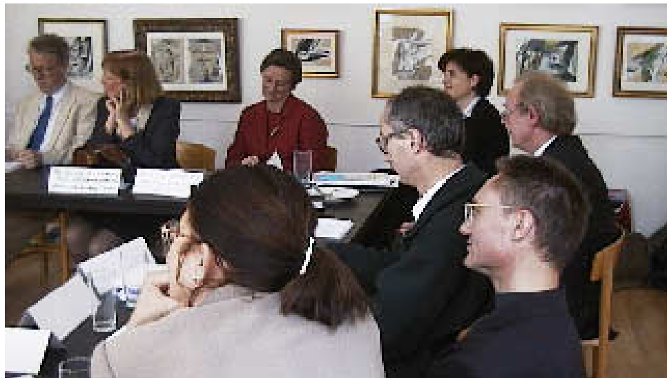
The general assembly at work II

to ensure that research results are implemented into the education and practical conservation/restoration activities of end users.